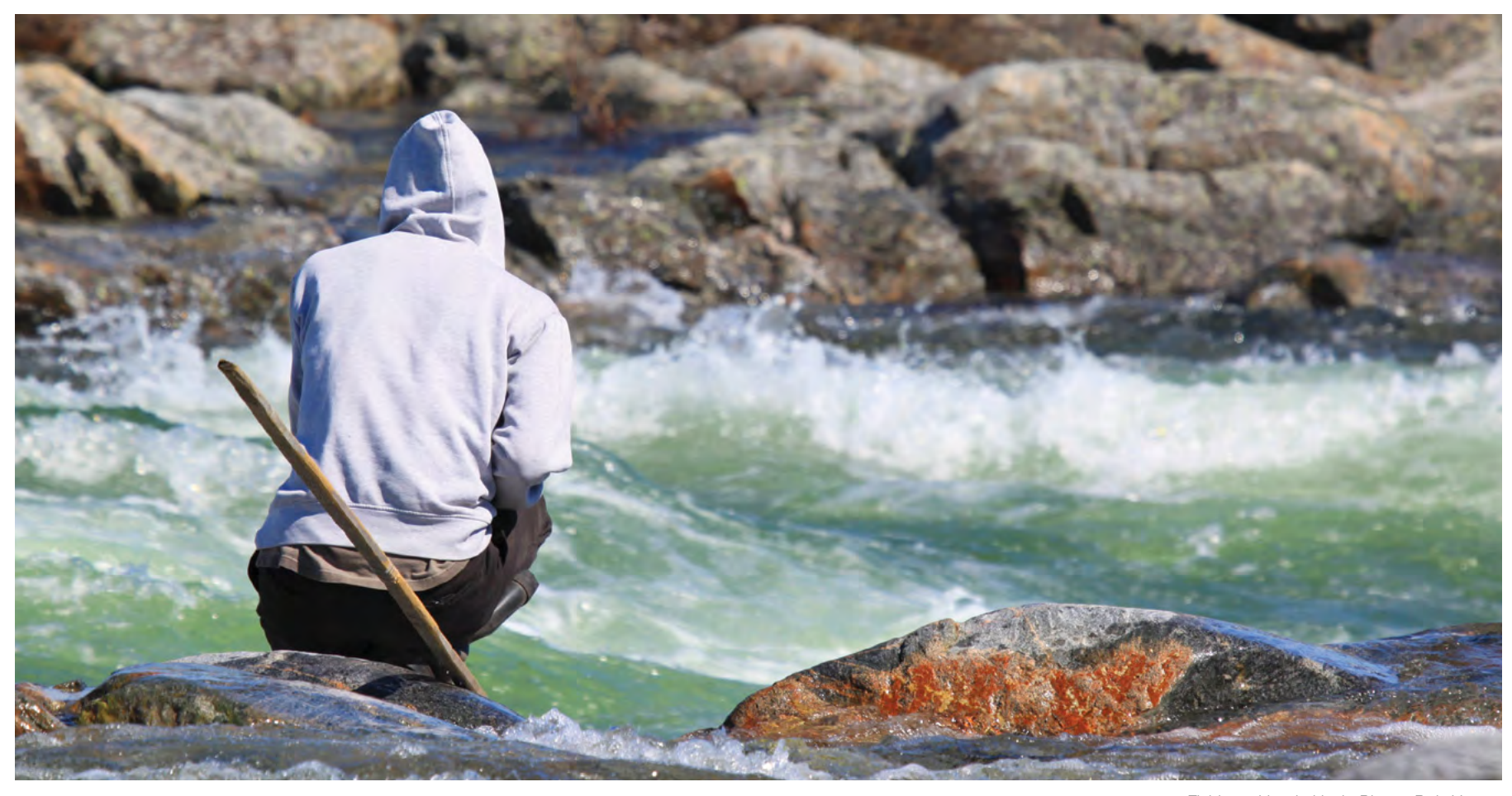
Fishing with a kakivak