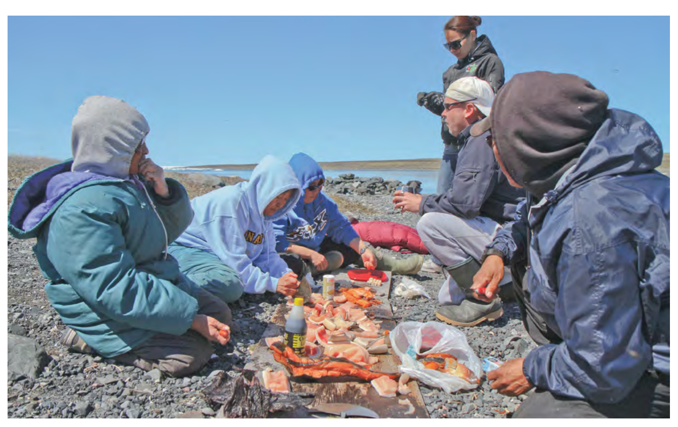
Inuit Qaujimajatuqangit day in Sanikiluaq

The NIRB puts a lot of emphasis on how a proponent has or will work with Inuit to incorporate Inuit Qaujimajatuqangit into their activities. For example, when discussing potential impacts to wildlife a proponent must extend that discussion to potential impacts on harvesting and communities. Proponents must demonstrate how they are integrating local knowledge and scientific knowledge into their project design to manage potential environmental and social impacts.