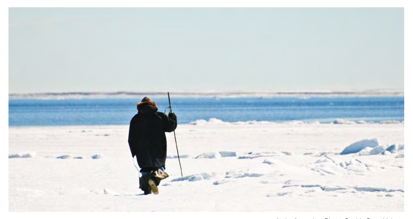
At the flow edge

This Public Guide will help you learn what you can do to get involved in Screening.